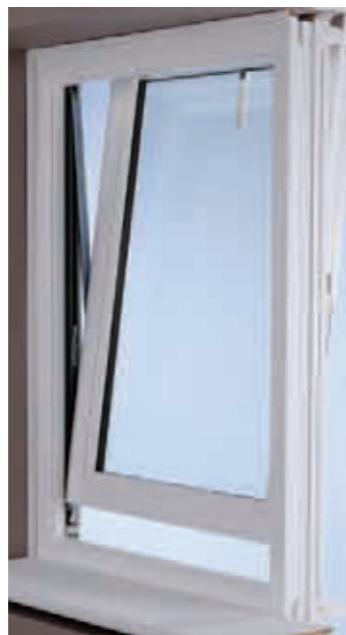
Top Swing fully reversed position