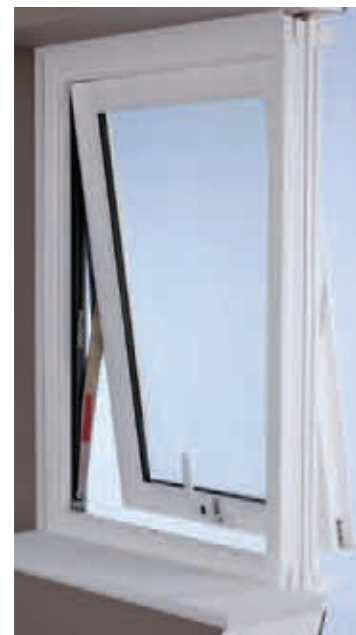
Top Swing first restriction point