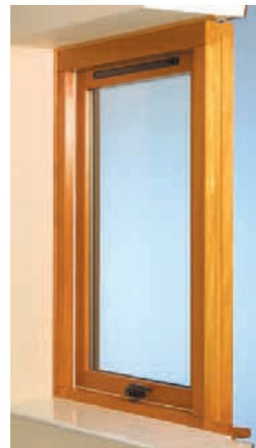
Top Hung (interior)