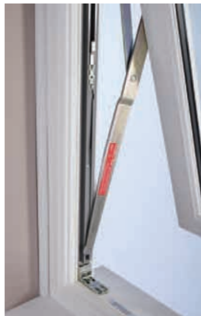
Top Swing restrictor second position